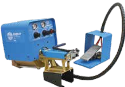
S75099 Pneumatic Junior ® Clamp Application Tool