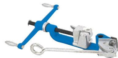
C00269 Junior ® Preformed Clamp Tool

BAND-IT ® Junior ® Smooth ID Preformed Clamps