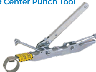
S03869 Center Punch Tool

Versatile ratchet tool applies 3/8" and 5/8" Center Punch Clamps.