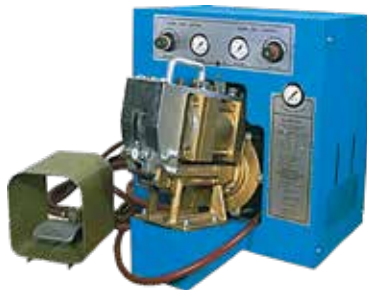
S35099 Pneumatic Junior ® Clamp Automatic Air Tool

BAND-IT ® Junior ® Smooth ID Preformed Clamps