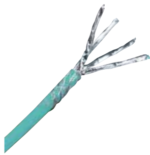
0 337 88