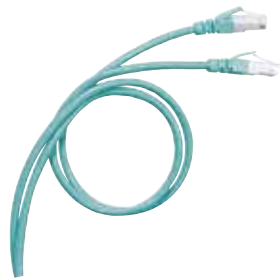
0 337 03