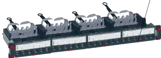
0 337 72