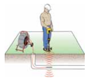
Find sondes (remote transmitters).