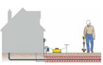
Direct connect to utility lines.