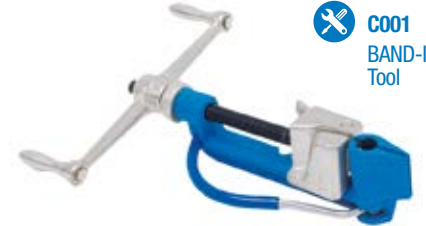
C001 BAND-IT® Tool