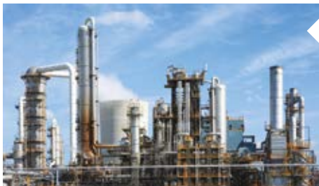
Refineries / Petrochem