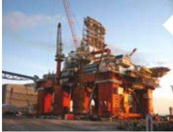
Offshore Platforms / FPSO's

Successfully utilised on the following applications: