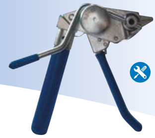
C075 Bantam Tool