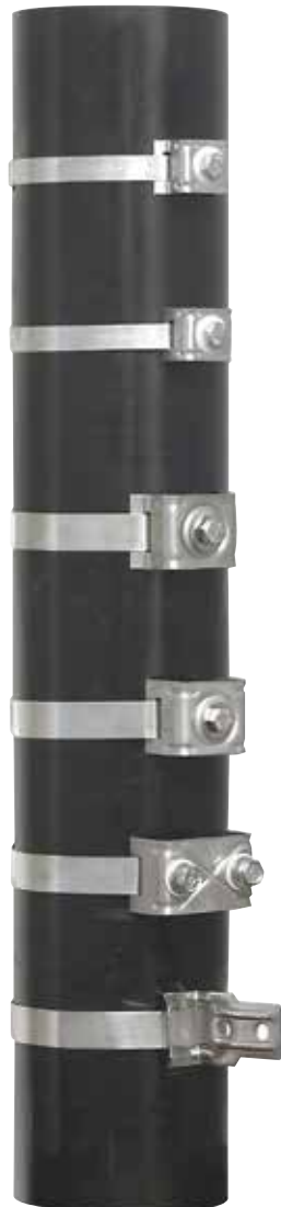
D31099 Flared Leg Mini-Brack-It