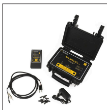
AT-100N Kit Apliweld-E: Ignition kit