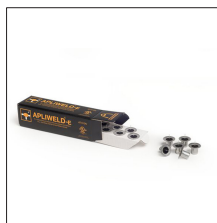
AT-010N Apliweld-E: Electronic starter (10ud)