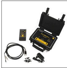
AT-114N Ignition Unit Apliweld®-E