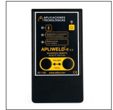
AT-115N Wireless remote control