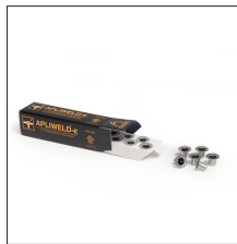
AT-010N Apliweld-E: Electronic starter (10ud)