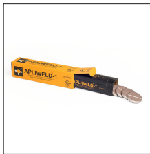
AT-020N Apliweld-T: Welding tablets (20u)