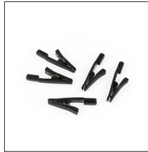
AT-099N Clamps renewal (5 units)