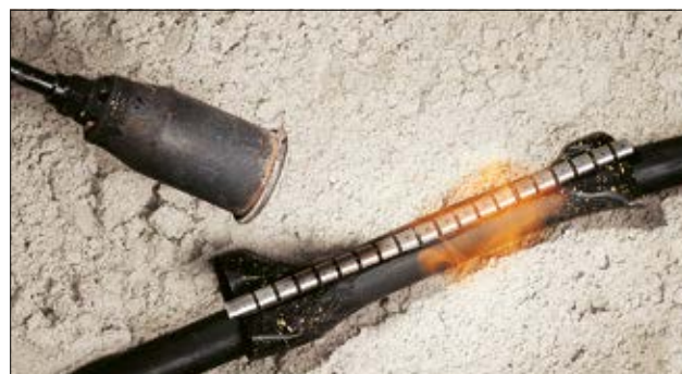
RMS wrap-around sleeves for rapid and secure cable repair.