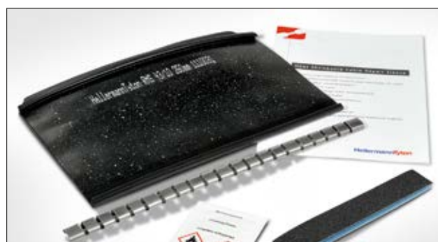
RMS: Repair sleeve, steel closure, abrasive strip, cleaning sachet, instruction sheet.